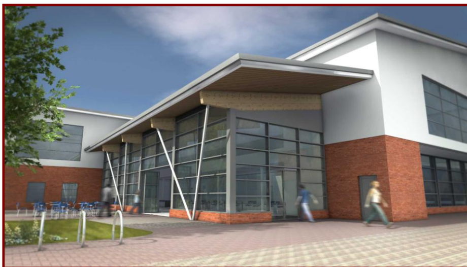
Artists' impression of the new leisure centre